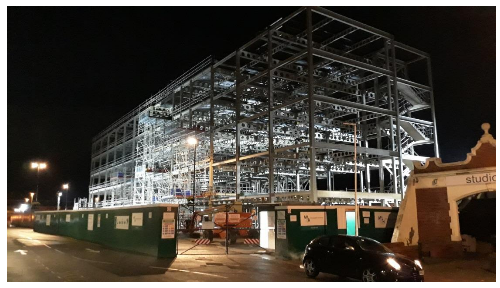
Teville Gate House construction, December 2019